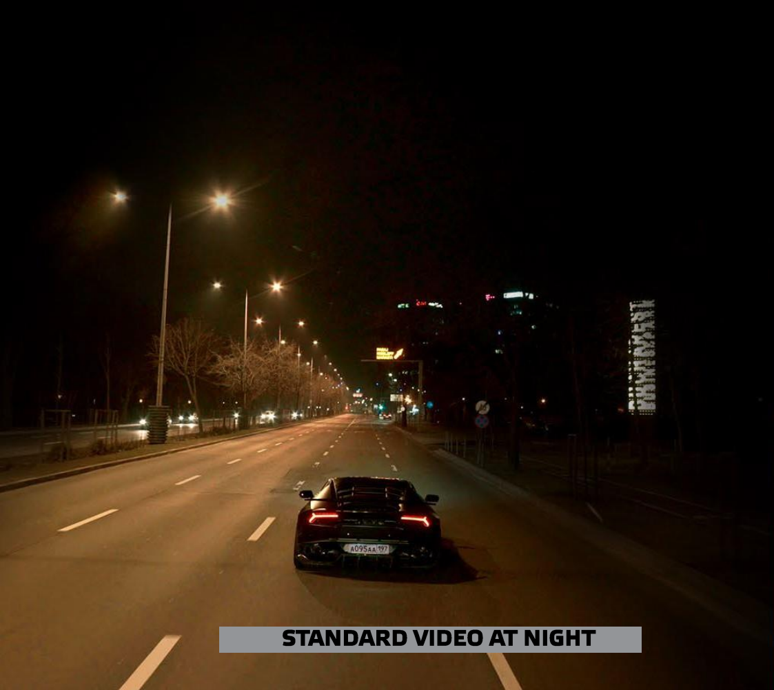
STANDARD VIDEO AT NIGHT