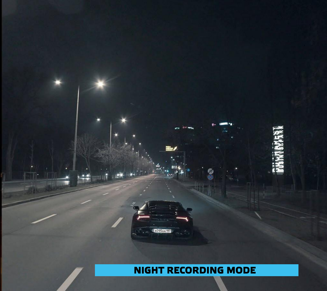
NIGHT RECORDING MODE