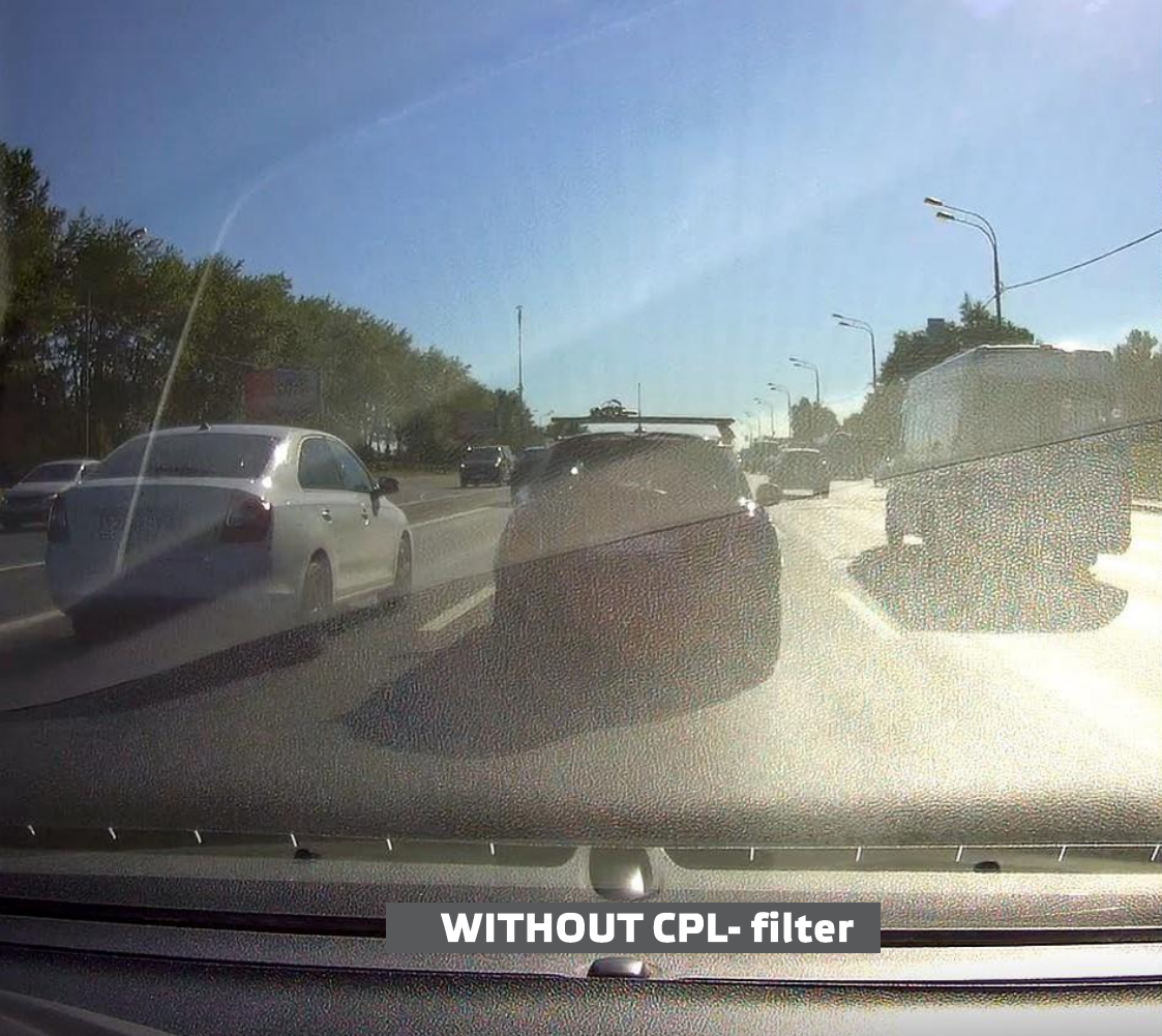
WITHOUT CPL- filter